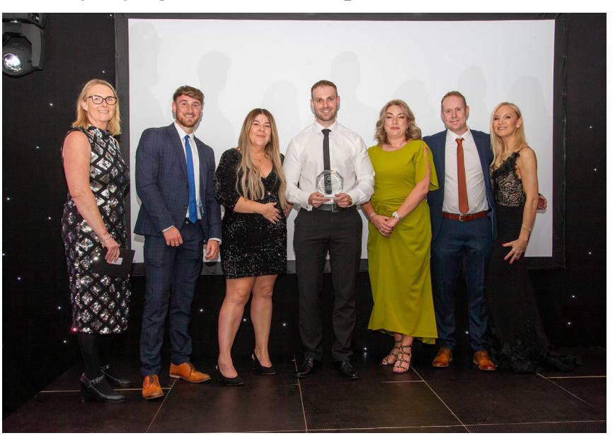
Chair Award: Procurement and Paediatric Emergency Department