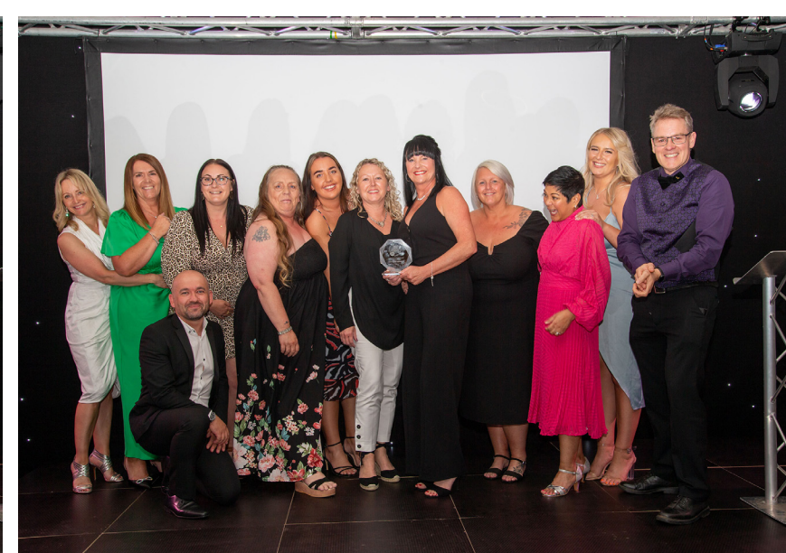
Team Outstanding Achievement Non-Clinical Award: Endoscopy admin