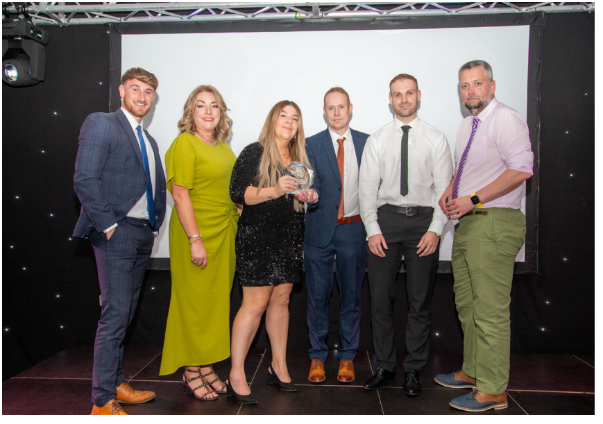
Innovation and Quality Improvement Award: Procurement and Paeds ED