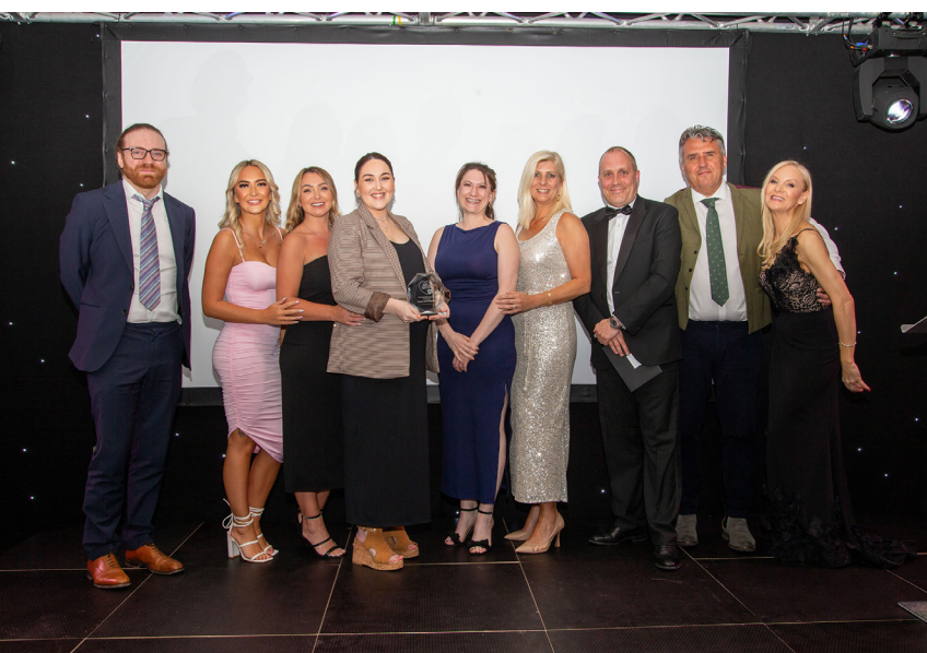
Team Outstanding Achievement Clinical Award: Trauma and Orthopaedics