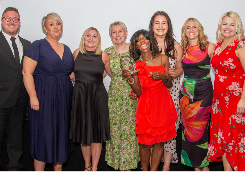
Partnership Award: Inclusion and Wellbeing and Project Search